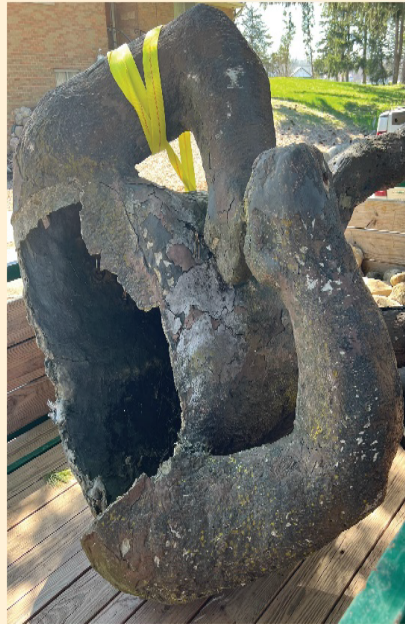
(Fig. 2, Big Mo as found by police, removed from storage, 2021)