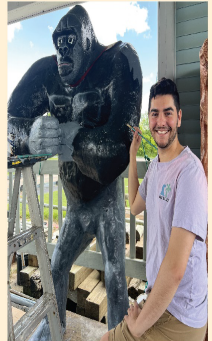
(Fig. 3, The next generation restores 'Mo,' 2024)